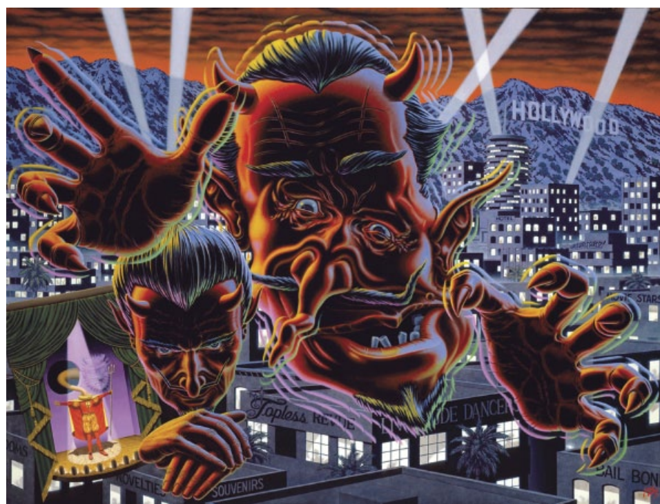
Hollywood After Midnight , 2007, Oil on canvas, 50 x 66 inches

Beware, desultory gallery visitor, because his art isn’t just gaudy, grizzly, psychotic, and image-guzzling; it’s also highly infectious. Once seen, it goes directly into your bloodstream—and there’s no known antidote to this stuff, aesthetic or otherwise. It seers your eyeballs, makes your knees freeze, your liver quiver, and turns your synapses into a freeway off-ramp. Any questions?