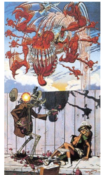
Appetite for Destruction , 1979, Oil on canvas, 15 x 28 inches

loud, lewd, and out of control—which is why Guns N’ Roses used his painting and title “Appetite For Destruction,” 1979 on the cover of their album eight years later, where a hideous chrome-toothed orange space monster zaps a robot about to rape a blonde female street peddler.... Wait a minute, I can’t describe this ! You just gotta see it. Not surprisingly, art academia was aghast at this aesthetic whiplash. It was as if the Hells Angels had vroomed into the hallowed white space of the gallery on their Harleys threatening to gang-bang the Mona Lisa.