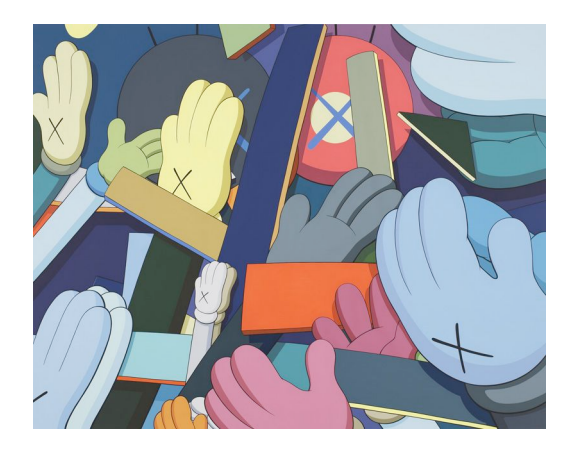
Kaws's Curtain, 2008.

The Williamsburg studio of the artist known as KAWS is neatly lined with racks of acrylic-paint bottles in primary colors and guarded by a cluster of standing toy collectibles—life-size 3-D comic book characters of his own design—like a platoon of robot children. By the window, there is a small-scale model of the Aldrich Contemporary Art Museum, in Connecticut. KAWS, an unassuming, soft-spoken 35-year-old New Jersey native named Brian Donnelly, is plotting his first solo museum show at the Aldrich next month. It will serve as the unofficial grand induction to the institutionalized art world for the graffiti artist, painter, illustrator, sculptor, toymaker, and product designer. Yet KAWS has a long history outside of the white cube. His street-born cartoonish graphics—specifically spermatozoa-shaped figures with x-ed out eyes—have achieved a subcultural iconography. He has applied this KAWS signature to his street art, a clothing line, heroically outsize toys and sculptures, and countless cobranding ventures with labels like A Bathing Ape and Marc Jacobs.