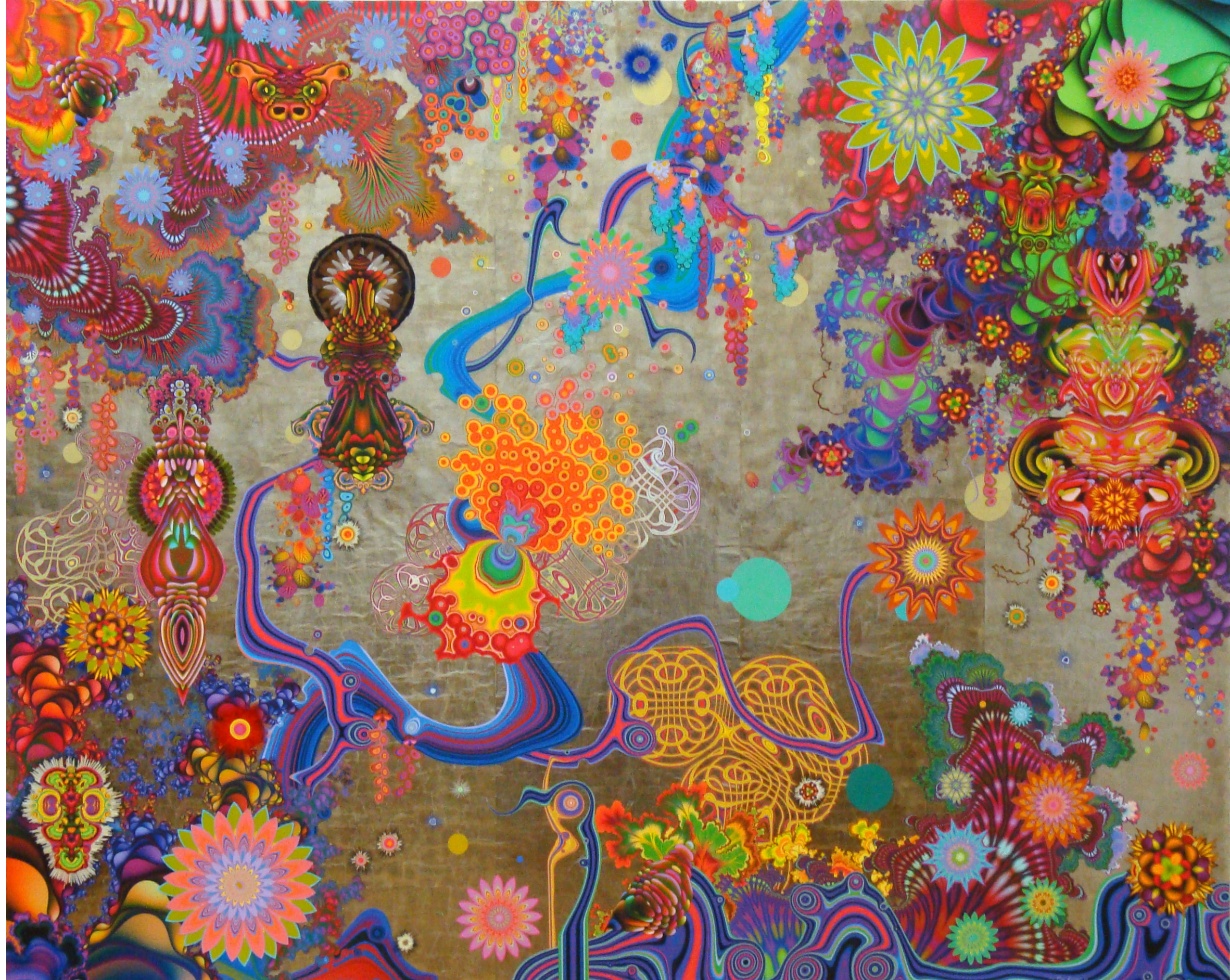
THE PROGRESS OF INSPIRATION, 2008, ENAMEL, GOUACHE, FEATHERS, PORCUPINE QUILLS ON MICA, 72 X 90", COURTESY THE ARTIST AND GAVLAK GALLERY, PALM BEACH

When Alvarez returned to making artworks, he transferred this knowledge into spectacular collages of natural elements, which may be imbued with meanings associated with science and mysticism or, simply, aesthetic appeal. Some are layered over brightly hued watercolors that verge on the hallucinogenic, others are composed entirely of single elements, such as a square of glimmering sheets of mica or a circle of peacock feathers, demonstrating the seductive power of modernism.