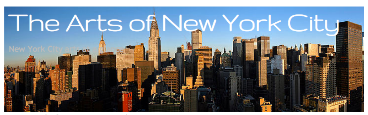
New York City arts at a glance