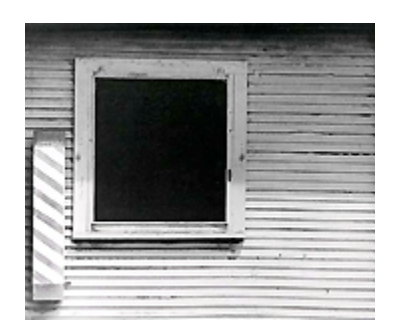
Arnold Newman's Barbershop Pole, West Palm Beach, Fla., 1940 ), at Howard Greenberg Gallery