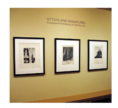
"Sitters and Signatures," photographs by Arnold Newman, at Howard Greenberg Gallery