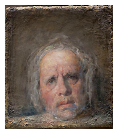
Odd Nerdrum's Self-Portrait (Head on a Table) at Forum Gallery