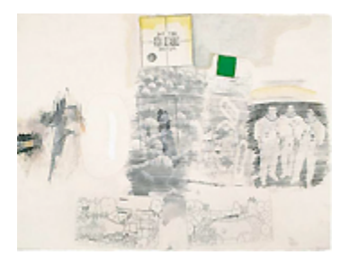
Robert Rauschenberg's Untitled (1968) at O'Hara Gallery