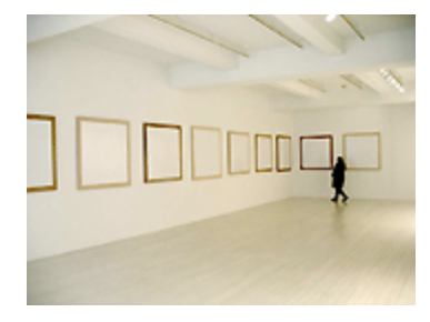
Robert Ryman's No Title Required (2006) at PaceWildenstein

that had covers custom-designed by artists (thanks to the bravado of my co-editor, Edit deAk ). Dorothea Rockburne designed a cover that was folded on the diagonal (by hand, by us, all 2,000 copies), and we used potato stamps to hand-print red, blue and yellow roses for Pat Steir 's cover image. In 1975, Ryman did the cover for our special "painting issue," with that same perfect eccentricity, repositioning the magazine title, which was in Boldoni type, in the middle of the cover and spelling out "painting" in capital sans-serif letters directly beneath it.