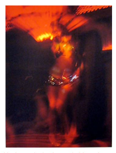
Mikhail Baryshnikov's Untitled (2006) at Edwyn Houk Gallery