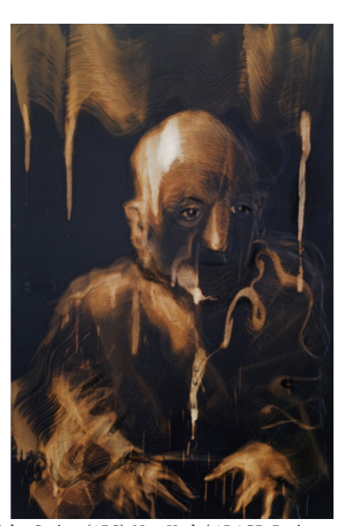
Courtesy\ Acquavella\ Galleries\ \textcircled{@ 2014}\ Artists\ Rights\ Society\ (ARS), New\ York\ /\ ADAGP,\ Paris