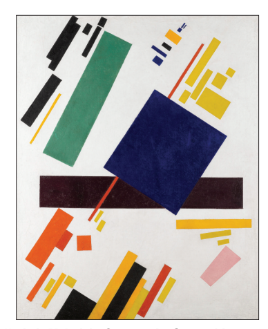
Kazimir Malevich, Suprematist Composition , 1916, oil on canvas, 34%" x 28", Kunsthaus Zurich.

While Picasso was the most commanding presence—30 paintings in all, representing several phases of his career—a particularly strong grouping of Modiglianis, a spectacular pairing of Kandinsky's Studie zu Improvisation 3 (Study for Improvisation 3, 1909) and Malevich's Suprematist Composition (1916), and Matisse's Portrait au manteau bleu (Portrait in a Blue Coat, 1935) also stood out. A