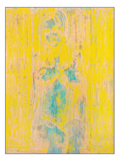
Enoc Perez, Nude, June 2011, oil on canvas, 80" x 60". Faggionato Fine Arts.

Paradoxically, the more the image was applied, the less it can be detected.