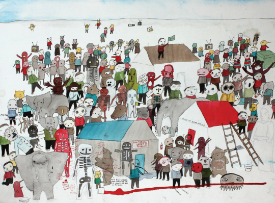
Neil Farber, Fraternal Order of Peasants , 2011, mixed media on birch, 30" x 40". Pippy Houldsworth.

The results sometimes smartly recall the Lodge's best, most unsettling work. In Fraternal Order of Peasants , an assemblage of cute but vaguely creepy figures, houses, and ladders tips into a sense of dystopian unease. The sprawling, six-